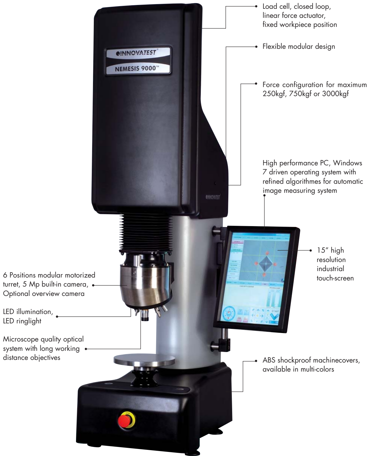
NEMESIS 9000™ SERIES 0.5KGF TO 3000KGF, 6 POSITION MOTORIZED TURRET